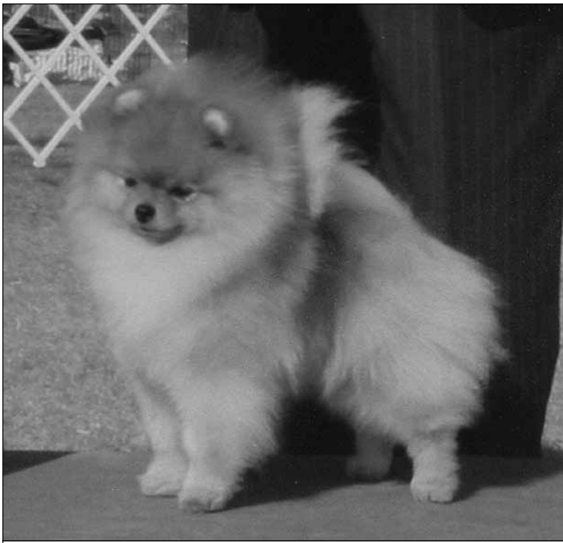
BISA, GCH Horizon's A Fly On The Wall HOF "Wally"