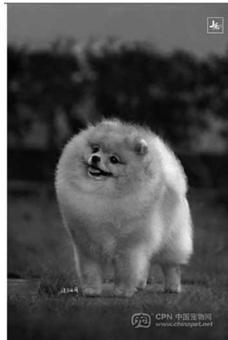
CH Carleez Defies All Logic ("Logan")