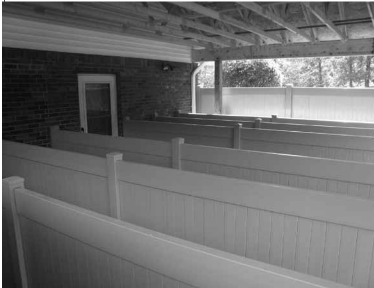
Below: Separate areas under the roof in the side dog yard (Left) and The big fenced play yard (Right)